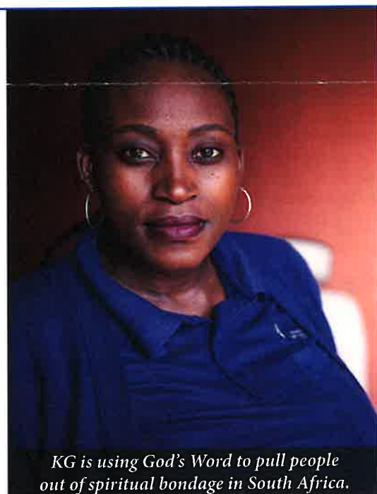
KG is using God's Word to pull people out of spiritual bondage in South Africa.