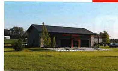
THE HAVEN INTERIOR & EXTERIOR